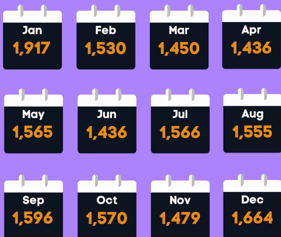
Number of Registered Death by Province/Highly Urbanized City