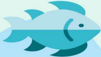
TOTAL VOLUME OF PRODUCTION (MT)