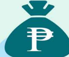
TOTAL VALUE OF PRODUCTION (BILLION)