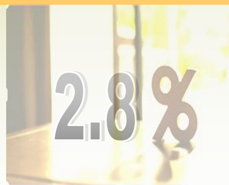
Year-on-year change of average CPI for June 2024 vs. 2023

Inflation Rate (IR) Rate of change in the average price level as measured by the CPI between two periods