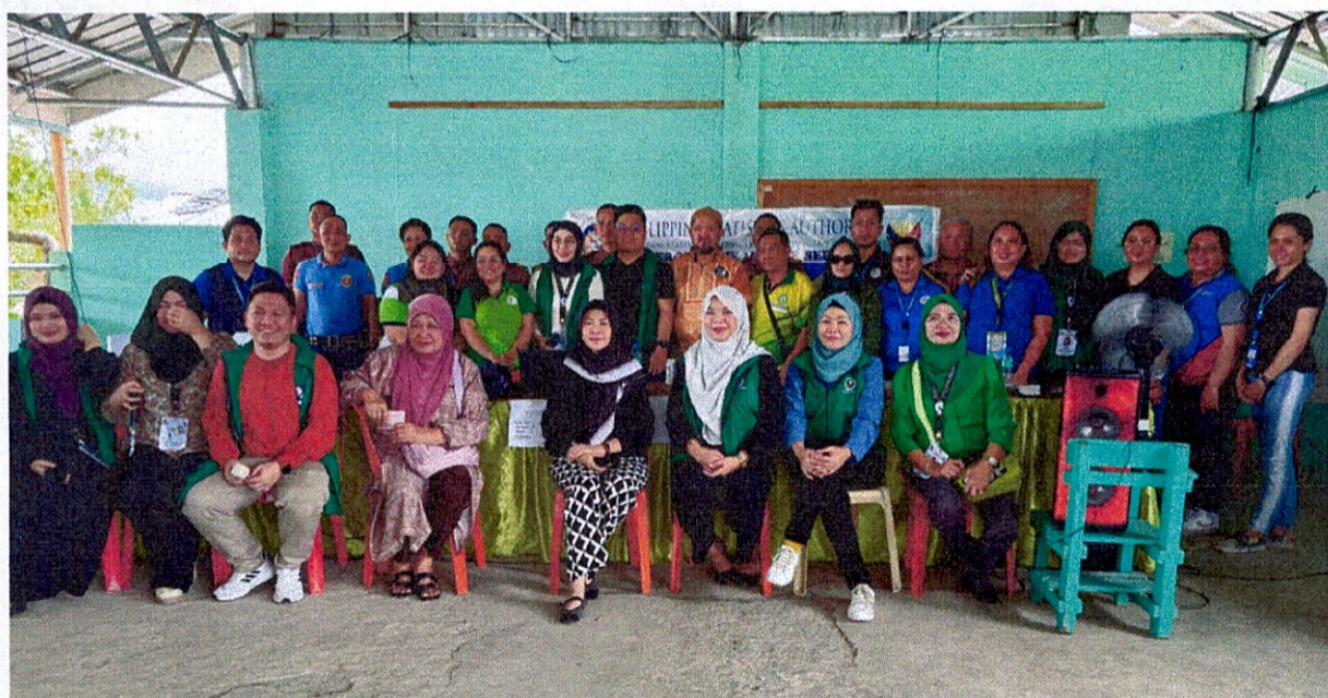
National Commission on Muslim Filipinos Personnel with PSA Regional CRS Mobile Team and PSA Provincial National ID Team.

The Philippine Statistics Authority (PSA) Regional CRS Mobile Team and Surigao del Sur's National ID Team partner with the National Commission on Muslim Filipinos (NCMF) to enhance the delivery of services to the Muslim community at the City of Bislig, Surigao del Sur.