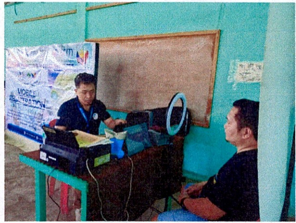
PSA Provincial National ID Registration

During the mobile service, the PSA Regional CRS Mobile Team catered to requests of vital documents. These documents vary from Birth Certificates, Marriage Certificates and Death Certificates. Overall, there was a total of 99 that were catered. Moreover, the provincial National ID Team catered to 78 new registrations.