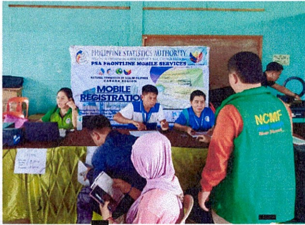
PSA Regional CRS Mobile Team