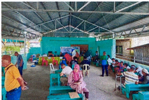
Mobile Service Venue at Bislig City

During the mobile service, the PSA Regional CRS Mobile Team catered to requests of vital documents. These documents vary from Birth Certificates, Marriage Certificates and Death Certificates. Overall, there was a total of 99 that were catered. Moreover, the provincial National ID Team catered to 78 new registrations.