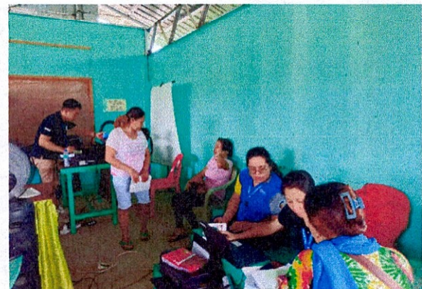
Provincial National ID Team

PSA's involvement in this event underscores its dedication to fostering collaborative efforts that drive positive change in communities throughout the province.