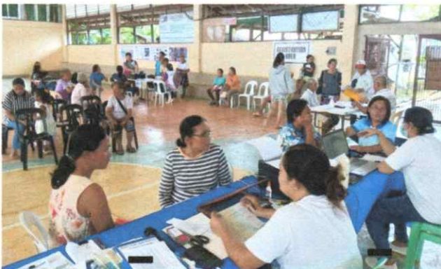
Staff of the Local Civil Registrar's Office - Cagwait birth registration interview

On 20 February 2025 the Office of the LCRO of Cagwait conducted its Mobile Registration at the Covered Court of Brgy. Bitagan West, expected clients for this mobile registration are constituents from Brgy. Bitagan East and West, as well as Brgy. Mat-e.