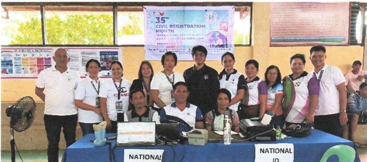
National ID- SDS Team with the LCRO Cagwait Staff and Brgy. Officials of Brgy. Mat-e, Bitagan East and West.

Date of Release: 25 February 2025 Reference No. 2025-01