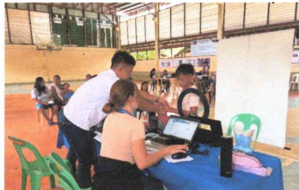
National ID Registration Kit Operator with LCRO Staff.