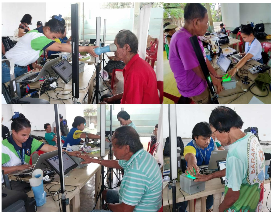
National ID Teams assisting every senior citizen in getting their National ID.

24 June 2025 – CLAVER, SURIGAO DEL NORTE. In collaboration with the Municipal Government Unit of Claver, the Philippine Statistics Authority Surigao del Norte delivered National ID services to senior citizens of Claver. This initiative proves the government's commitment to inclusivity and social welfare.