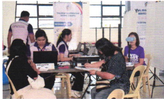
Day 1 of Bagong Pilipinas Serbisyo Fair, March 22, 2024

The Philippine Statistics Authority (PSA) Caraga, in collaboration with PSA Agusan del Norte, took part in the Bagong Pilipinas Serbisyo Fair, a two-day event held at the Caraga State University (CSU) Main Campus in Butuan City on March 22-23, 2024. This initiative aimed to extend essential services to the community.