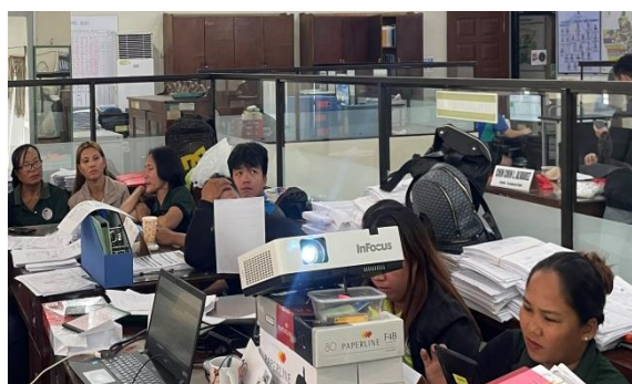
Enumerators during the conduct of the 3 rd level Training of PCPS.

The PCPS and RCSS will be conducted from December 1 to 10, 2023, including Saturdays and holidays. The sample for Palay is 100, and the sample for Corn is 76. The RCSS-Household and Commercial samples had 351 and 99 respondents, respectively.