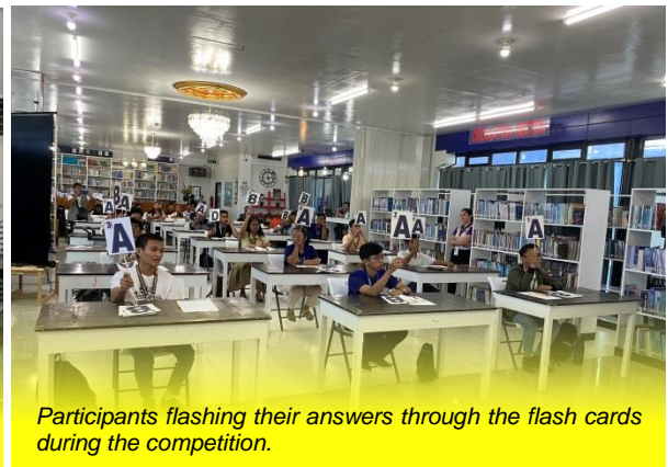
Participants flashing their answers through the flash cards during the competition.

On November 6, 2023, the Philippine Statistics Authority of Agusan del Sur conducted the 27 th Philippine Statistical Quiz – Provincial Elimination at Southway College of Technology (SOCOTECH), San Francisco, Agusan del Sur.