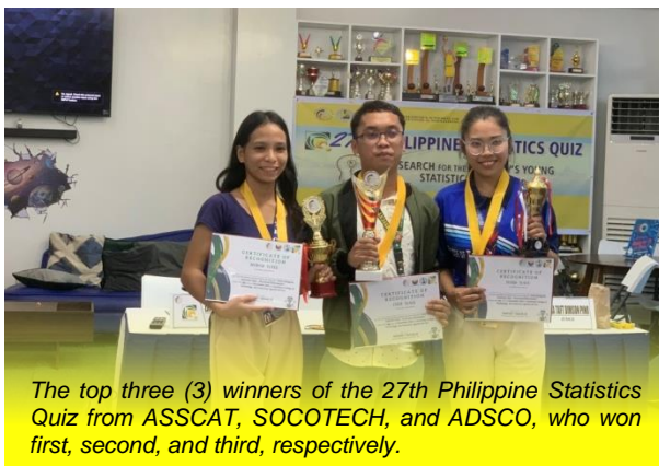
The top three (3) winners of the 27th Philippine Statistics Quiz from ASSCAT, SOCOTECH, and ADSCO, who won first, second, and third, respectively.