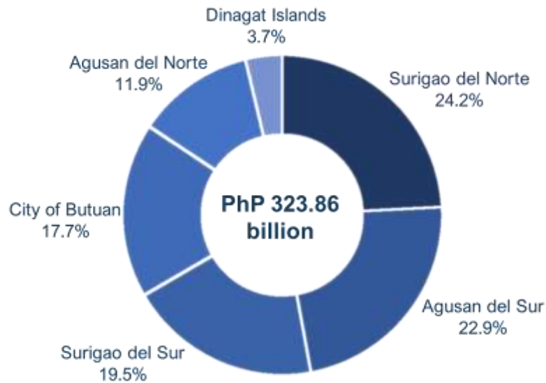
Figure 2. Share of Provinces and HUC in 2022 GRDP of Caraga, at Constant 2018 Prices

Note: Details may not add up due to rounding.