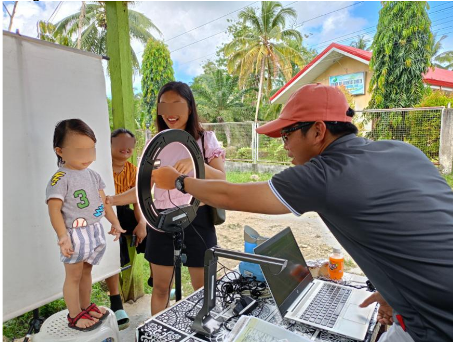
Mobile Registration at Brgy. Magkiangkang, Bayugan City, Agusan del Sur

As of May 17, 2024, a total of 26,481 children were registered in the region, with Agusan del Norte recording the highest number at 10,573 registrations, followed by Agusan del Sur with 9,043, Surigao del Norte with 3,663, Surigao del Sur with 2,514, and Dinagat Islands with 688 registrations.