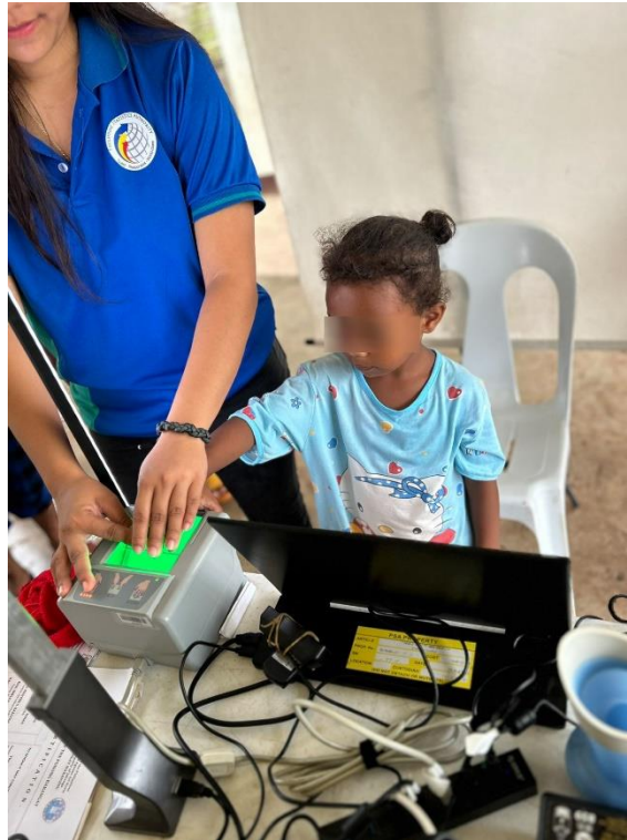
Mobile Registration at Brgy. Maraiging, Jabonga, Agusan del Norte

Any of the following supporting documents may be presented to validate the demographic information of the child: