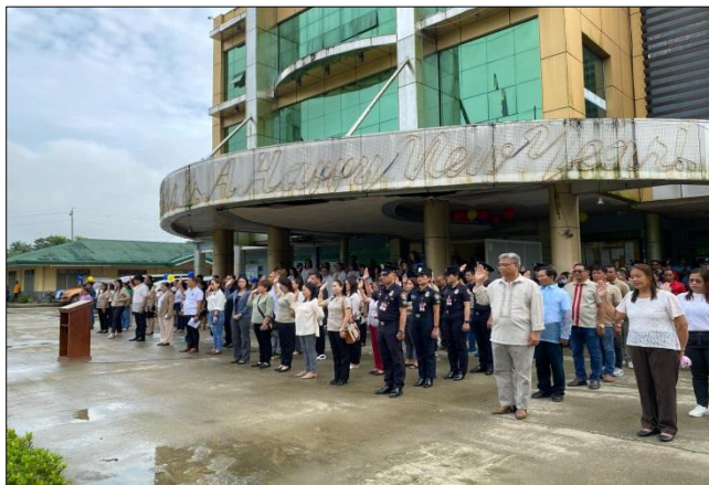
PSA personnel, LGU Rosario officials and employees, and uniformed personnel participate in a flag-raising ceremony on February 3, 2025 at the Municipal Ground, Rosario, Agusan del Sur

The Provincial Statistical Office (PSO) of Agusan del Sur, in collaboration with Local Civil Registry Offices (LCROs) and the Local Government Unit (LGU) of Rosario, officially launched the 35th Civil Registration Month (CRM) during the LGU Rosario flag-raising ceremony on February 3, 2025. This year's celebration carries the theme, "Building a Resilient, Agile, and Future-Fit Civil Registration and Vital Statistics System".