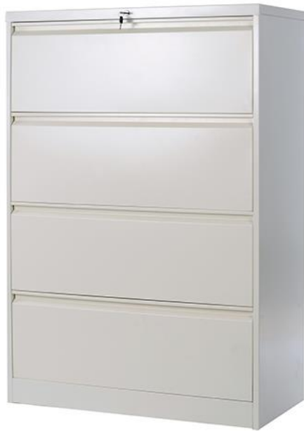
Lateral Filing Cabinet, 4 shelves, 90cmx45cmx133cm