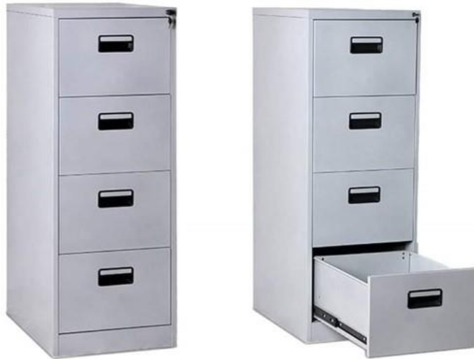
Filing Cabinet, 4 shelves, 62cmx46cmx134cm